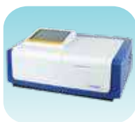
UV/VIS Spectro 2080+ Double Beam

Analytical Technologies is synonymous for offering technologies for doing analysis and is the Fastest Growing Global Brand having presence in at least 96 countries across the global. Analytical Technologies Limited is an ISO:9001 Certified Company engaged in Designing, Manufacturing, Marketing & providing Services for the Analytical, Chromatography, Spectroscopy, Bio Technology, Bio Medical, Clinical Diagnostics, Material Science & General Laboratory Instrumentation. Analytical Technologies, India has across the Country operations with at least 4 Regional Offices, 6 Branch Offices & Service Centers. Distributors & Channel partners worldwide.